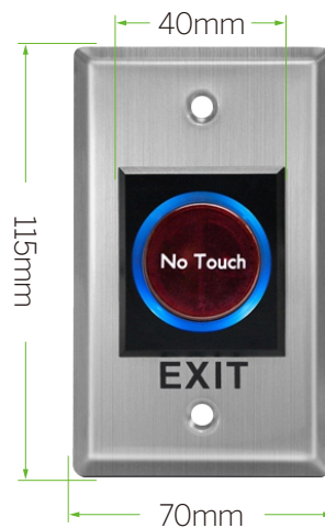
EB-16 115 x 70 x 25mm