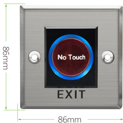
EB-17 86 x 86 x 35mm