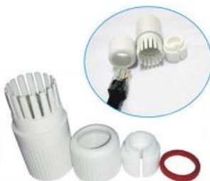
GNT-5313Cover Four set waterproof Cover (Optional)