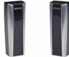
Photocells XP 15 B

IMPORTANT: The new S 700 H automated systems replace the 760 automated systems which, as from OCTOBER, will no longer be available.