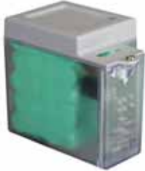
emergency battery kit XBAT

(*) The E 700 board is designed exclusively for these photocells.