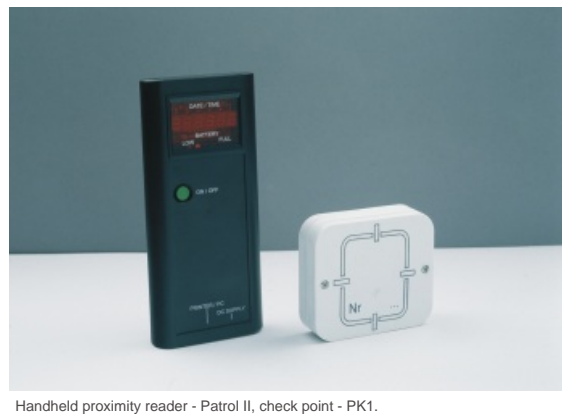
Handheld proximity reader - Patrol II, check point - PK1.

The device is offered in the following set: PATROL II - reader, PATROL Master - software, computer-reader cable, leather holder, two AA 1.5V batteries, power supply unit.