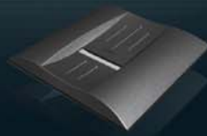
FC (Atmel's FingerChip)