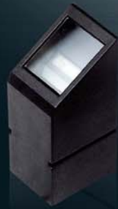
OP, OD (Optical Sensor)