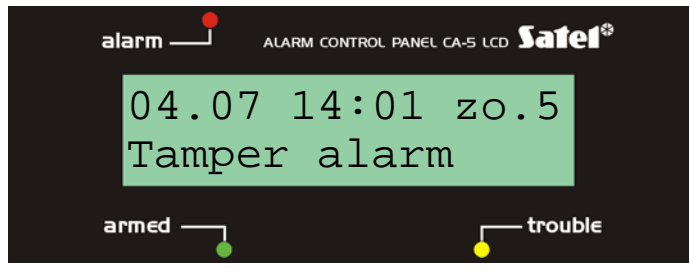
Fig. 3. Example of events description.

<u>To start the viewing</u>, call the function and press any of the arrow keys - information on the most recent alarm condition, referring to selected function, will be displayed. The ([\blacktriangle], [\nabla]) arrow keys on the right side of the keypad allow the user to scroll through the list of events provided by the alarm control panel. The events are displayed chronologically ( [\blacktriangle] - earlier ones, [\nabla] - later ones).