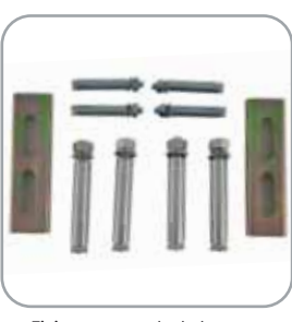
Fixing ground plate

Barrier automation with integrated control unit