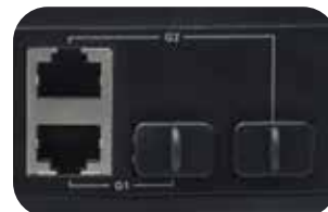
Combo Slot (1000Mbps RJ-45 / SFP)