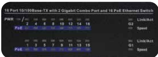
LED Status display

*Uplink Ports cannot work simultaneously with the SFP ports