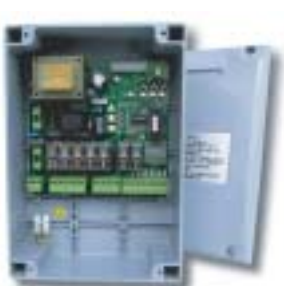
Control boards: 230V ac and 24V dc, safe and simple to program.