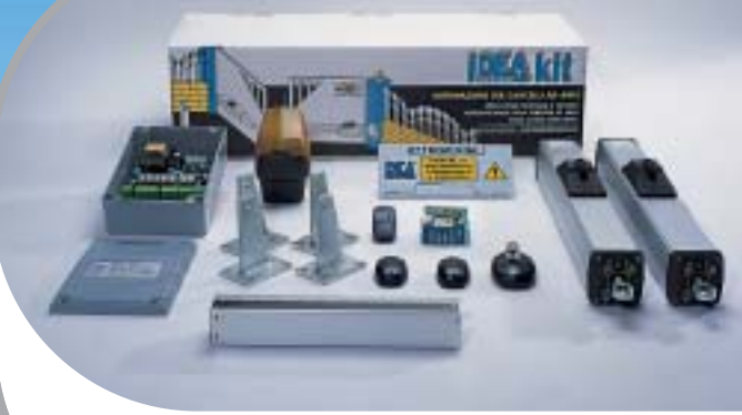
IDEAKIT 602/1 Complete automation with DEA original accessories.