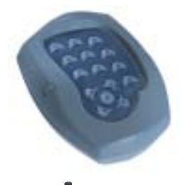
Digikey: Safe and reliable, available wireless and hard-wired.