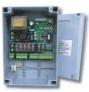
Control boards: 230V ac and 24V dc, safe and simple to program.