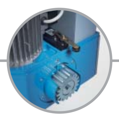
Integrated limit-switch in opening and closing.