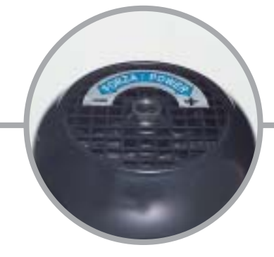
Anti-crushing safety thanks to the mechanical clutch.