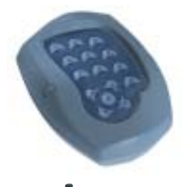
Digikey: Safe and reliable, available wireless and hard-wired.