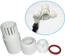
GNT-5313Cover Four set waterproof Cover (Optional)