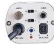
AC100V / AC230V