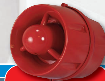
ActiV Hi-Output 100dB(A) Wall Sounder (deep base)

Certified to EN54-3 Alarm Current at 30Vdc = 5.5mA Alarm Current at 18Vdc = 3.8mA IP33C (Type B) rated IP55 weatherproof version also available (order code BF430C/CC/DR/65)