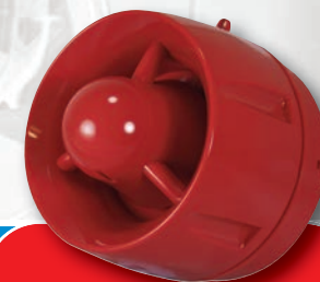
ActiV Hi-Output 100dB(A) Wall Sounder (shallow base)

Certified to EN54-3 Alarm Current at 30Vdc = 5.5mA Alarm Current at 18Vdc = 3.8mA IP21C (Type A) rated