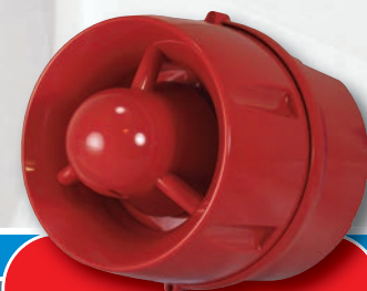
ActiV Hi-Output 100dB(A) Wall Sounder (deep base)

Certified to EN54-3 Alarm Current at 30Vdc = 5.5mA Alarm Current at 18Vdc = 3.8mA IP33C (Type B) rated IP55 weatherproof version also available (order code BF430C/CC/DR/65)