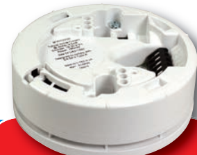
ActiV 96dB(A) Base Sounder

Certified to EN54-3 Alarm Current at 30Vdc = 5.5mA Alarm Current at 18Vdc = 3.8mA Supplied with a quick connect plate and detector spur wires Optional white & red caps IP21C (Type A) rated Suitable for use with most makes of conventional fire detector