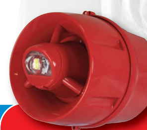
ActiV Hi-Output W-2.75-9 Wall VAD c/w 100dB(A) Sounder (deep base)

Certified to EN54-3 & 23 Also rated as a W-4-4 VAD Alarm Current at 30Vdc = 12.2mA (0.5Hz) or 19.5mA (1Hz) Alarm Current at 18Vdc = 14.5mA (0.5Hz) or 25mA (1Hz) IP33C (Type B) rated IP55 weatherproof version also available (order code BF433C/CC/DR/65)