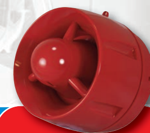
ActiV Hi-Output 100dB(A) Wall Sounder (shallow base)

Certified to EN54-3 Alarm Current at 30Vdc = 5.5mA Alarm Current at 18Vdc = 3.8mA IP21C (Type A) rated