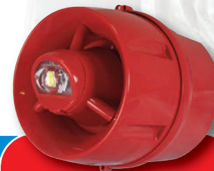
ActiV Hi-Output W-2.75-9 Wall VAD c/w 100dB(A) Sounder (deep base)

Certified to EN54-3 & 23 Also rated as a W-4-4 VAD Alarm Current at 30Vdc = 12.2mA (0.5Hz) or 19.5mA (1Hz) Alarm Current at 18Vdc = 14.5mA (0.5Hz) or 25mA (1Hz) IP33C (Type B) rated IP55 weatherproof version also available (order code BF433C/CC/DR/65)