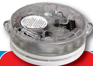
ActiV C-3-8.5 Base VAD c/w 96dB(A) Sounder

Certified to EN54-3 & 23 Alarm Current at 30Vdc = 12.2mA (0.5Hz) or 19.5mA (1Hz) Alarm Current at 18Vdc = 14.5mA (0.5Hz) or 25mA (1Hz) Supplied with a quick connect plate and detector spur wires Optional white & red caps IP21C (Type A) rated Suitable for use with most makes of conventional fire detector