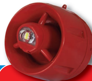
ActiV Hi-Output W-2.75-9 Wall VAD c/w 100dB(A) Sounder (shallow base)

Certified to EN54-3 & 23 Also rated as a W-4-4 VAD 100dB(A) sound output @ 1m Alarm Current at 30Vdc = 12.2mA (0.5Hz) or 19.5mA (1Hz) Alarm Current at 18Vdc = 14.5mA (0.5Hz) or 25mA (1Hz) IP21C (Type A) rated