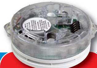
ActiV O-R-3-2.5-17 Base VAD c/w 96dB(A) Sounder

Certified to EN54-3 & 23 Ideal for use in corridors Alarm Current at 30Vdc = 12.2mA (0.5Hz) or 19.5mA (1Hz) Alarm Current at 18Vdc = 14.5mA (0.5Hz) or 25mA (1Hz) Supplied with a quick connect plate and detector spur wires Optional white & red caps IP21C (Type A) rated Suitable for use with most makes of conventional fire detector